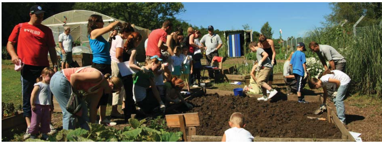
Greenmeadow Community Farm, Cwmbran

previous use may have been. This will be a concern for any project planning to consume, donate or sell produce or keep livestock.