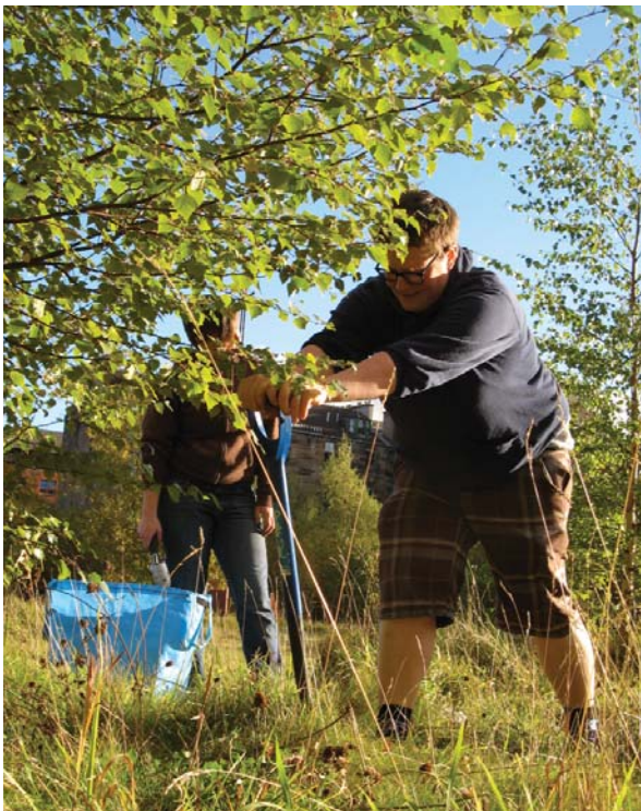
North Kelvin Meadow Campaign, Glasgow

have donated and the positive benefits to the local community that have resulted from their support. The task of reporting to funders will be made much easier if you keep appropriate records of the work, events and activities they have funded.