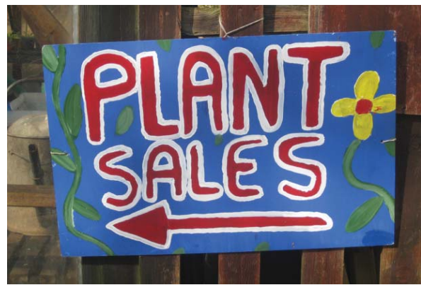
St Werburghs City Farm, Bristol

You will need to put in some organised planning and effort in order to attract donations-in-kind. Ideas include: