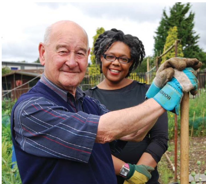
Walsall Road Allotments, Birmingham

turnover of more than £77,000 (at April 2012) a year, must register for Value Added Tax (VAT) and keep detailed records. This figure is usually changed annually.