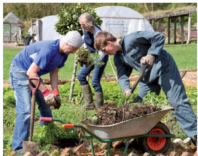
The Ecology Centre, Fife

There's no getting round the fact that employing people can be complex, adds to the administration of an organisation and requires a lot of good practice. However, by treating your workers well you can reap many rewards from a committed and enthusiastic staff member. Remember that all employees will have employment rights, such as entitlement to contracts, periods of notice, redundancy payments, claims for unfair dismissal, holidays, maternity and paternity leave etc.