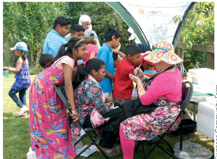
Swansea Community Farm

Appoint someone from your group to take responsibility for publicity - to build contacts with the media, in particular local newspapers, local broadcasters (radio and TV), local magazines and community