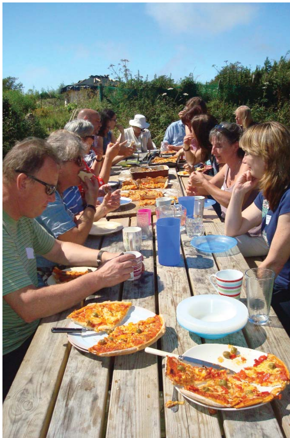
Felin Uchat, Pwllheli

others are doing, share problems and learn new skills.