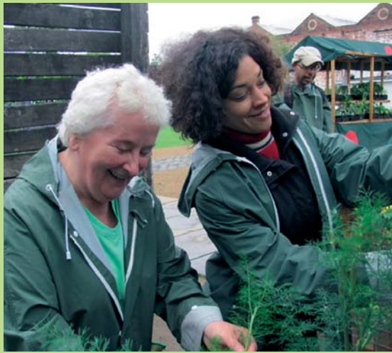
The Hidden Gardens, Glasgow