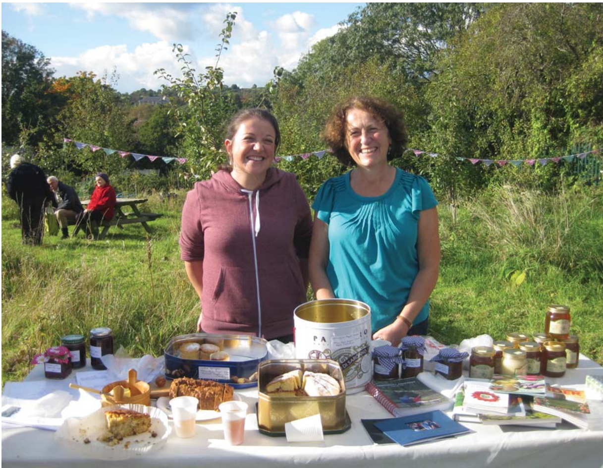
Fishponds Community Orchard, Bristol

The public meeting can be used in conjunction with the other consultation methods outlined below. Make sure representatives from local stakeholder groups and local councillors are all invited. This meeting could then be followed up by subsequent meetings as your group comes together or if there are important issues to discuss.