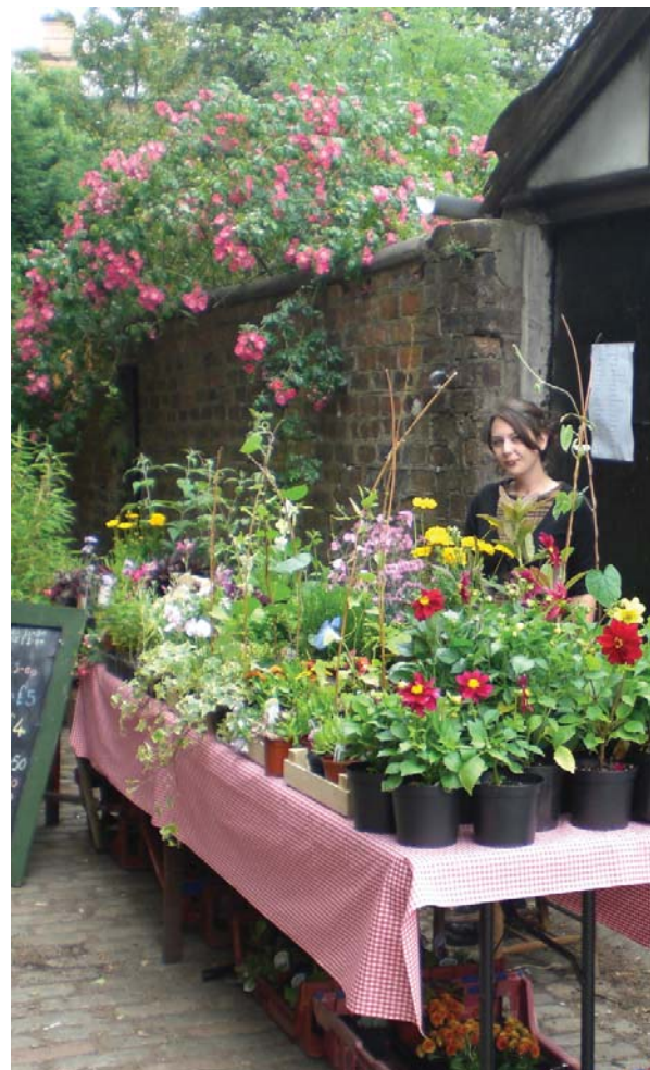
Alderman Road Community Garden, Glasgow

Providing practical training: You could charge a fee for people to attend a training workshop e.g. 'come and build a compost unit' or 'make and plant a hanging basket using herbs'. If you have the necessary skills within your group you could also run craft workshops, such as spinning and weaving.