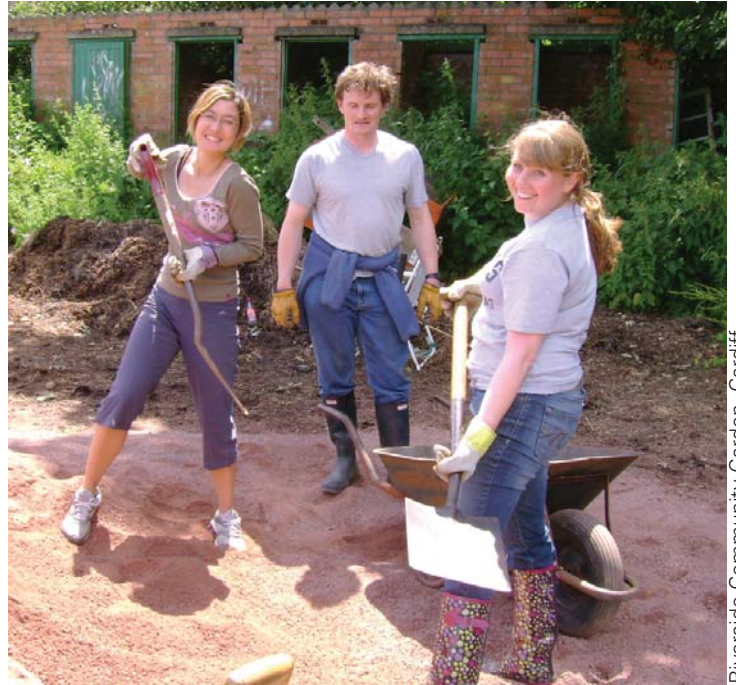
Riverside Community Garden, Cardiff

Remember: active members are your garden's most valuable resource. You will know from your records how to contact them and ask for help. Some of them will be future management committee members.