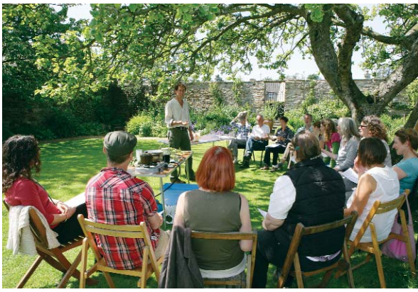
Reeth Community Orchard, Yorkshire

Your plan should include a statement about where you are now and where you aim to be in two or three years' time. The plan should be clear, concise, honest and accurate (e.g. ensure all your figures tally up across the document – if they don't it will lose credibility). Remember, the plan should be a working document that you can use on a regular basis, not something you put together then file away.