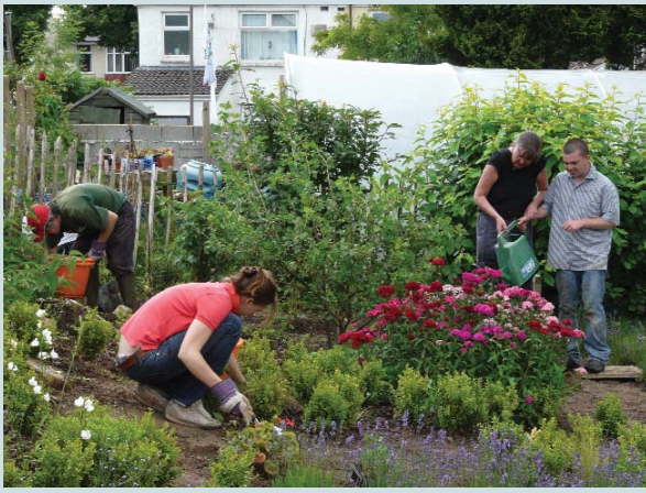
Fairwater Community Garden, Cardiff