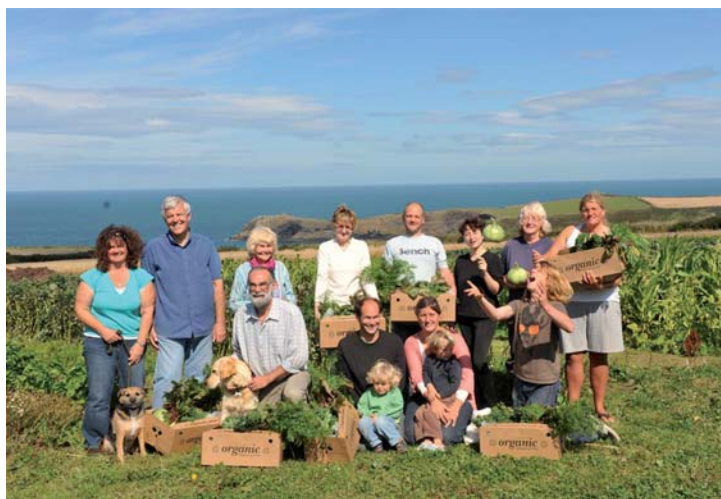
Caerhys Organic Community Agriculture, St Davids

There may be some brownfield, underused, waste ground or derelict sites available in urban areas. These landowners may welcome an income and participation on their land by the community if they do not have any immediate plans for the site or while the site is awaiting redevelopment (see Development Land below). However, bear in mind that derelict land - especially brownfield sites - could be contaminated and therefore the land may not be appropriate for food growing or it may cost a considerable amount to clear the contaminants.