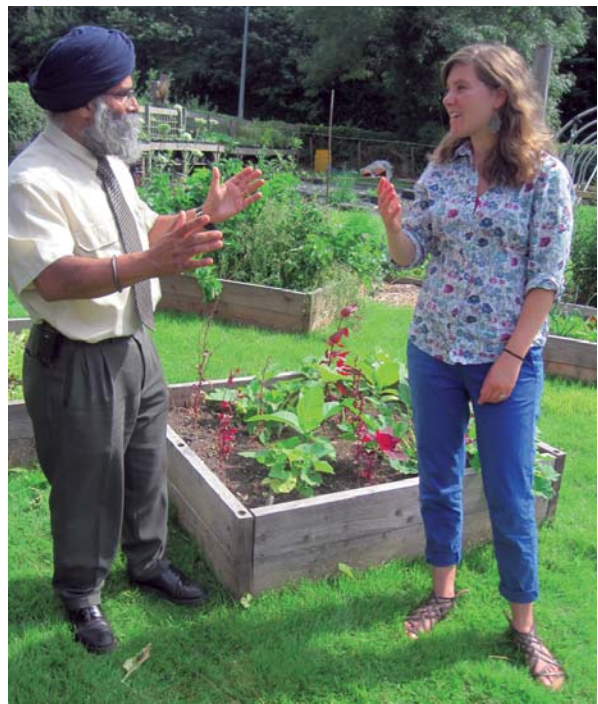
Cwm Harry Food Company