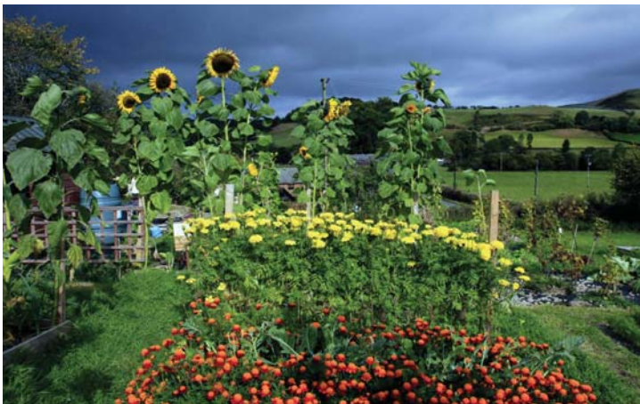
Knucklas Castle Community Land Project

Most existing community growing spaces do not own the land they use; some are on licence but most are leased. The majority pay a peppercorn rent, i.e. a nominal sum.