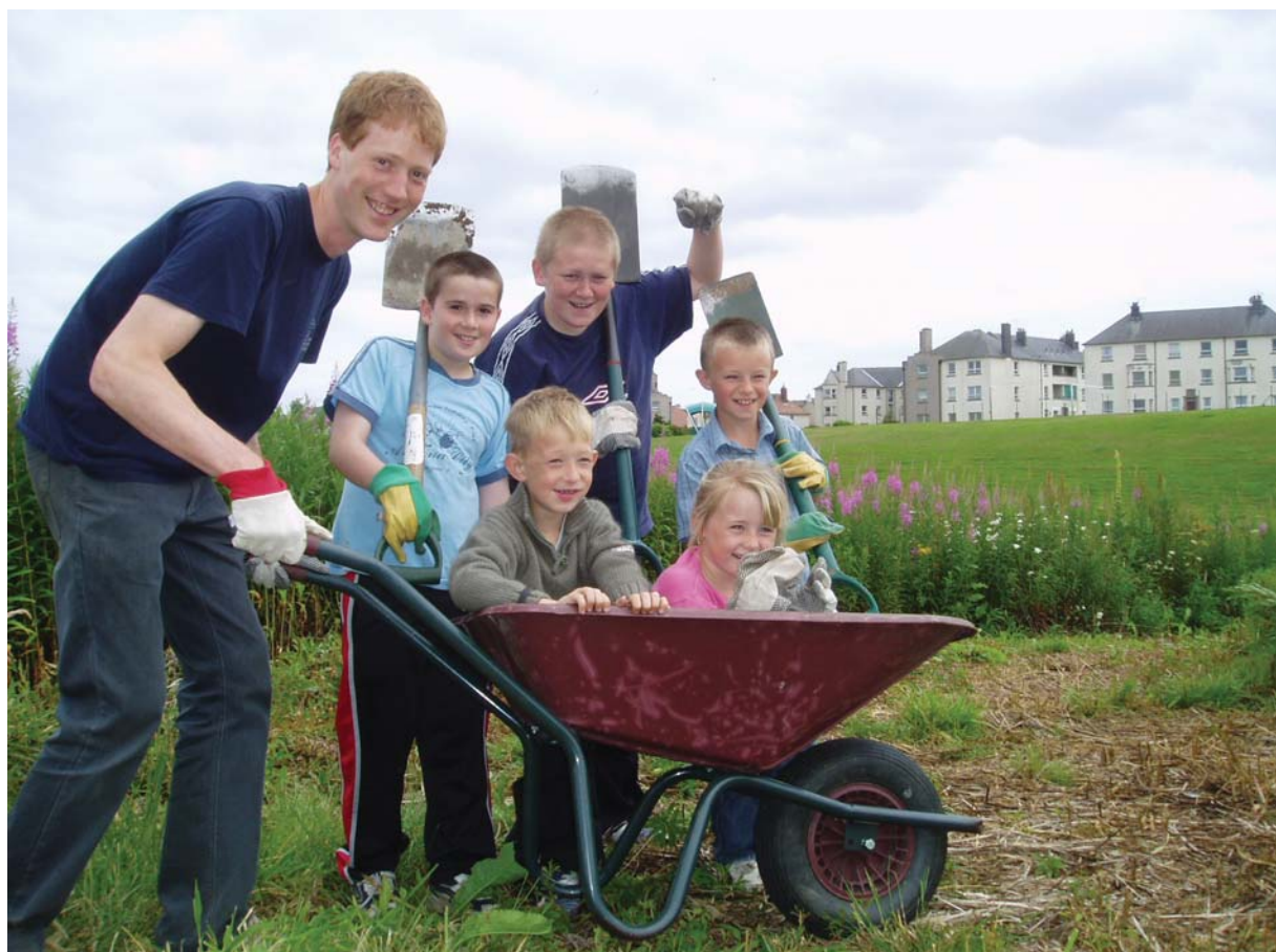
Healthy Roots, Aberdeen