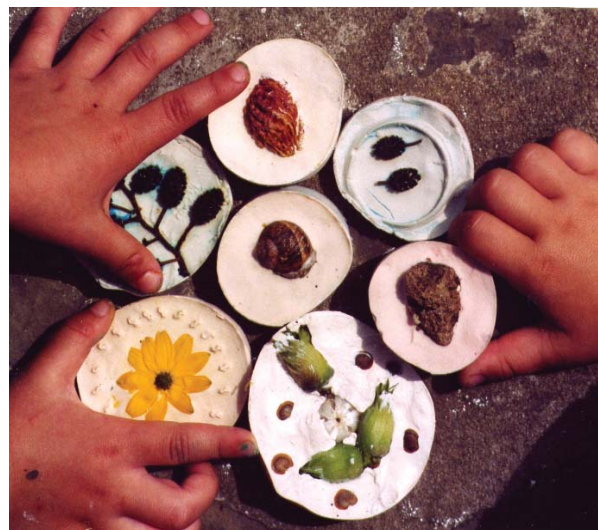
Culpeper Community Garden, London

Legal structures for community organisations fall into one of two broad categories: unincorporated and incorporated. It is vital to understand the differences between these two and their legal implications, particularly in relation to the potential personal liability of committee members.