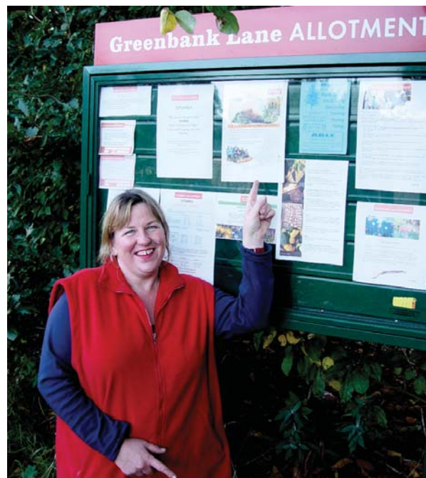
Greenbank Lane Allotments, Liverpool