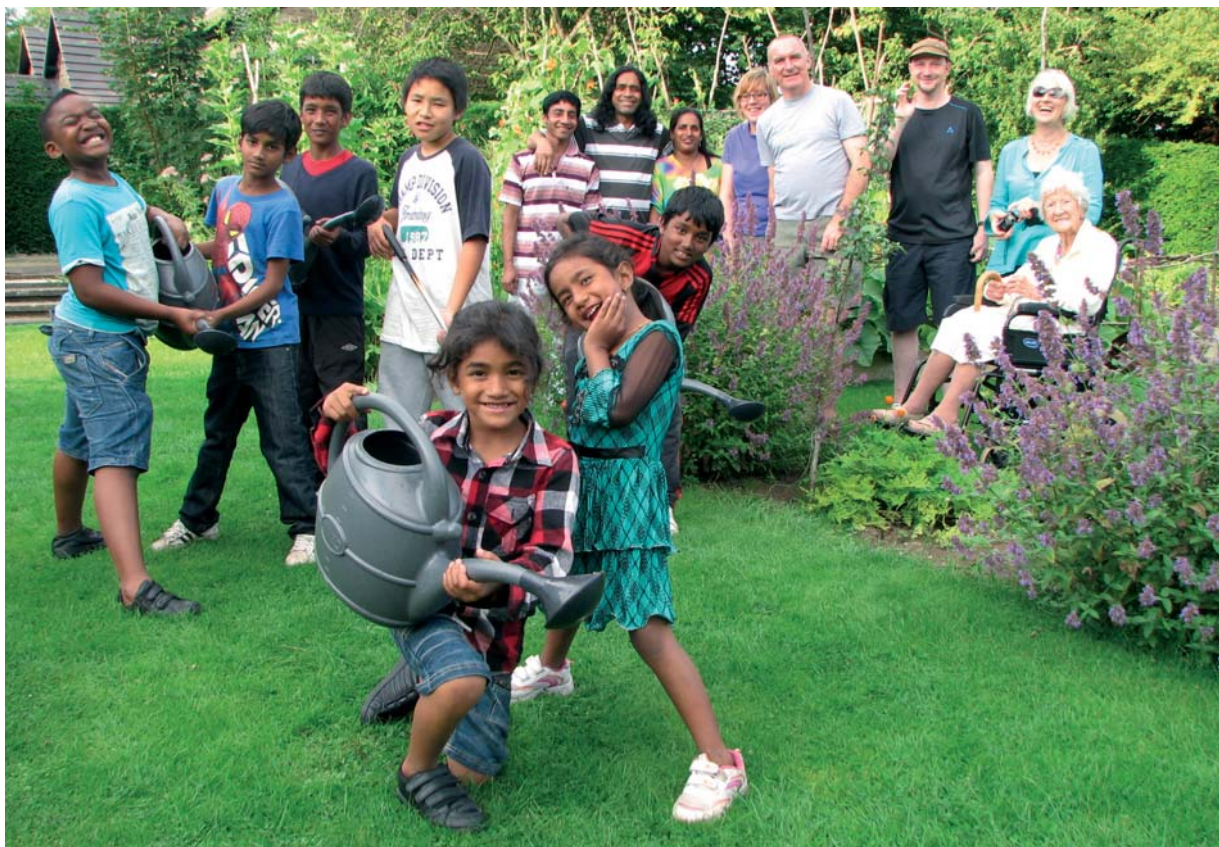
Queens Park Community Garden, Swindon

which they belong. This could lead to further offers of help, like donations in-kind; it's often who you know, and who knows them, that can help you in the future.